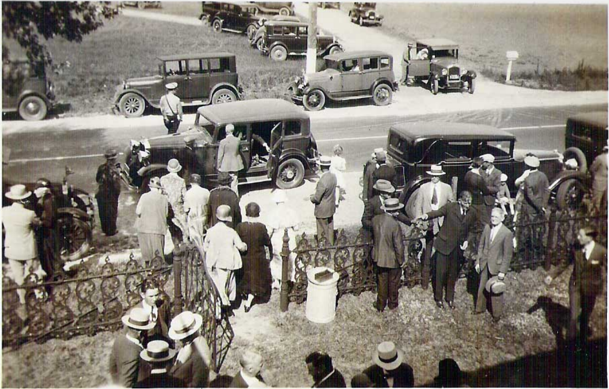
Looking from the balcony window to Main Street, Pastor Cook pointing, standing next to Justus Livingston (hat in hand).