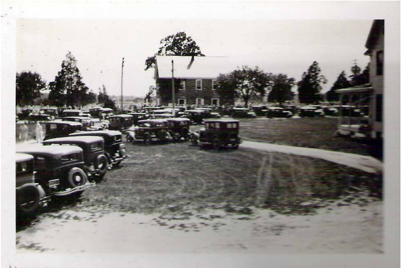
The view from the lot across the street from the Old Stone Church